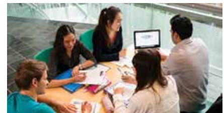
BCIT's students get top-notch training.

Across five campuses and 10 satellite locations, BCIT educates more than 47,000 full-time and part-time students every year in