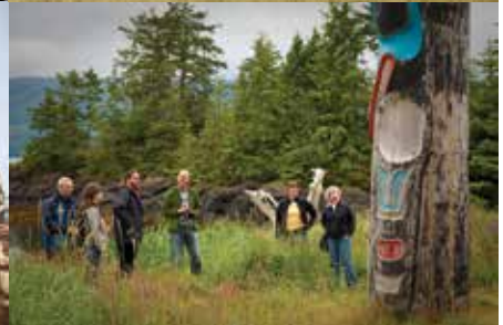
Spoiled for Choice: Aboriginal Tourism in British Columbia offer a wide variety of extraordinary travel experiences.

strongest economic drivers and culture revitalization in British Columbia that we have seen in years. It's a really great story," he said.