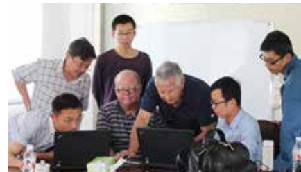
Majestic Gold's engineers at work.

Majestic Gold is a Toronto-listed (MJS-V), China-based gold producer with an open pit mine near Yantai in Shandong Province, the nation's largest gold-producing region. Majority control is held by Chinese nationals, who view the company as a vehicle to expand gold production both within and outside China.