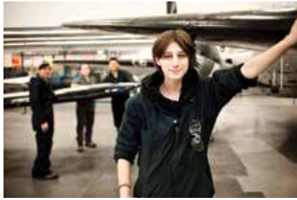
Centennial College boasts training in courses such as aviation (above) and provides its students with comfortable and conducive surroundings for learning.

With the international business landscape growing increasingly diverse and challenging, the college believes it is vital for its graduates to learn how to adapt quickly in