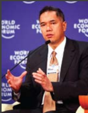
Gita Wirjawan, chairman of the Indonesia Investment Coordinating Board, speaks at the World Economic Forum in Davos, Switzerland

Indonesia is determined to achieve the potential befitting a country of its size and