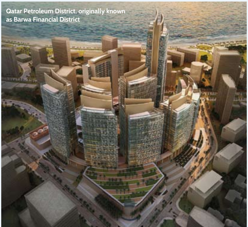
Qatar Petroleum District, originally known as Barwa Financial District

The country has clearly consolidated its position as a global business and investment hub and become a model in