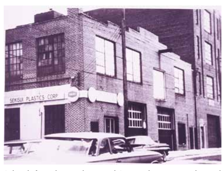
Sekisui's first plant in the United States. The Japanese chemical maker was the very first Japanese company to enter the country's manufacturing sector.