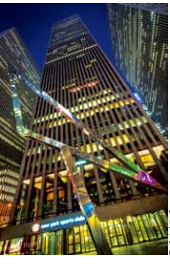
A New York landmark: 1221 Avenue of the Americas