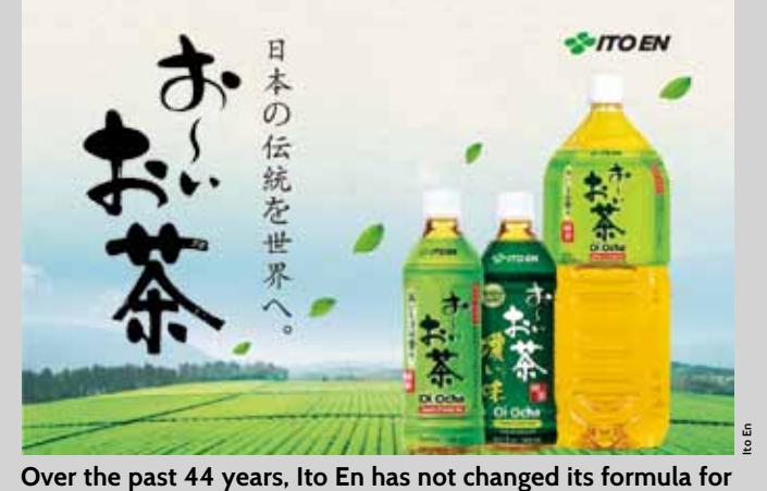
its green tea drinks: natural, healthy, delicious, safe and well-

In addition to the traditional "Oi Ocha" green tea drink found in Japan, Ito En also developed exclusively for the North American market the "Teas' Tea" line of drinks, which