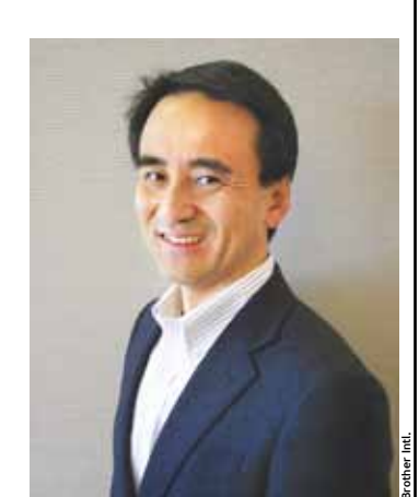
Brother International President

Under his watch, operations in the Americas now employ more than 1.200 people and generate $2 billion, which represents over 30 percent of the company's