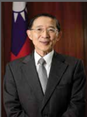
Foreign Minister David Lin of Taiwan

“The relationship between the United States and Taiwan