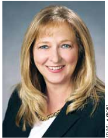
San Diego International Airport CEO Kimberly Becker

Switzerland. Overall, San Diego International Airport offers nonstop service to 61 destinations in the U.S. and 10 international destinations.