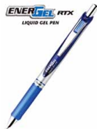
Pentel's EnerGel gel pens come in 8 barrel designs, 5 tip sizes and 12 super-smooth ink colors.

While its pencil leads and erasers dominate market share in the country, Pentel of America continues to be innovative in the pen category, with its revolutionary flagship EnerGel line becoming a bestseller. In recent years, Pentel of America has seen its EnerGel