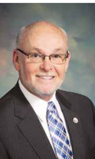
City of Torrance Mayor Patrick Furey

Located in the southwestern region of Los Angeles County, Torrance is a coastal city that ranks consistently among the 10 safest mid-sized cities in the U.S. Diverse in every aspect, Torrance boasts the highest