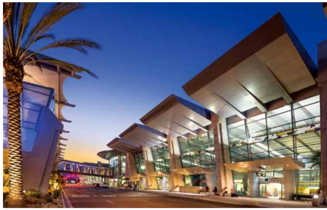
The facade of the recently renovated San Diego International Airport