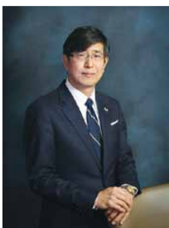
CONSUL GENERAL OF JAPAN

Of course, trade remains a focal point of discussions between both countries, following the U.S. withdrawal from the highly touted Trans-Pacific Partnership agreement.