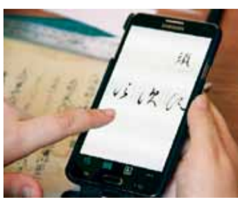
Users of the new app see kana, or Japanese syllables, displayed against richly decorated backgrounds taken from rare manuscripts.

On screen, students can study a handwritten Japanese syllable taken from a manuscript from the 15th to the 17th centuries. Then, they can "flip" the letterform to see the Chinese character from which it was derived. On the same screen, they can see how the syllable appears in a modern typeface. → www.ucla.edu