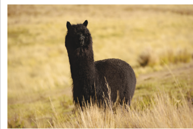
Inca Tops is making another kind of statement through its program to revive the black alpaca as a source for its yarns.