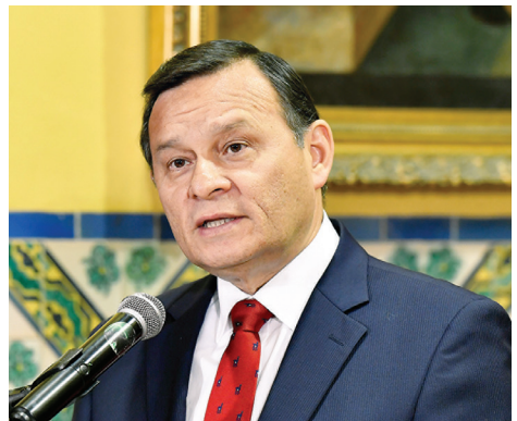
Ambassador and former foreign minister Nestor Popolizio