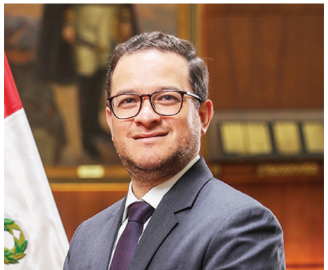
Peruvian Foreign Trade and Tourism Minister Edgar Manuel Vasquez