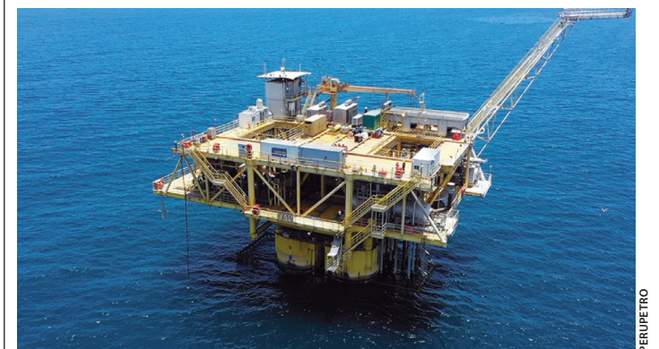
PeruPetro remains committed to the sustainable development of its oil reserves.