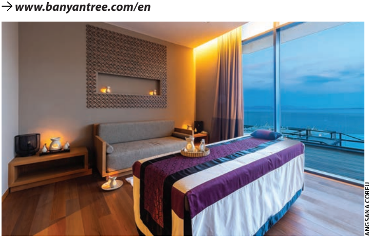
Eliminate your worries and stress at Angsana Spa

\rightarrow www.angsana.com/en/greece/corfu