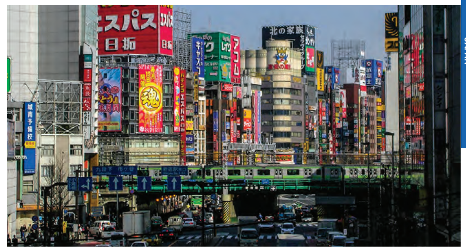
The government's economic stimulus plan dubbed Abenomics has remained effective in providing Japanese companies the much needed shot in the arm.

For Fuji Denshi , a unique manufacturer of induction heating machines, tapping the talent of its female workforce has also yielded positive results. In fact, it was named